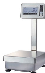
With optional pole kit